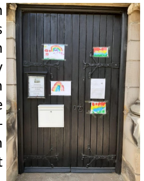
Holy Rood's door with the children's rainbows