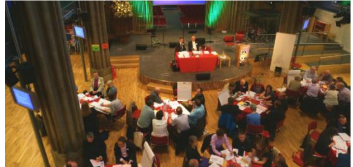
The SEC General Synod meets in P's & G's Church in Edinburgh

Please keep this 'in-person' Synod in your prayers as