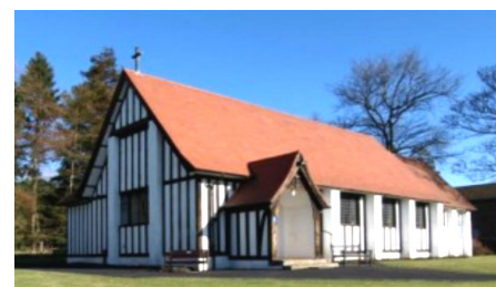
Holy Trinity Monifieth