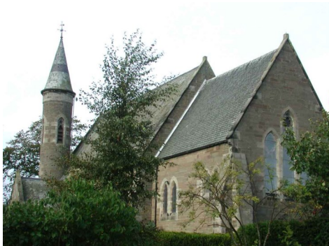
Holy Rood Carnoustie

The post advertised is for a 'Priest in Charge' and 'Transitional Minister' - the role involves settling the shared ministry between the charges, building up the strong lay teams in both churches and working on the mission and ministry of both churches in their different communities. The churches are sharing the costs and ministry, with the financial support of the Diocese to assist in getting the ministry started.