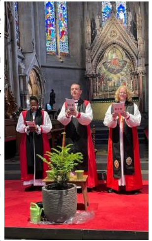
The tree is planted in the celebration service

The tree, a native yew, was planted in a temporary planter and will be transferred to a permanent location later in the year.