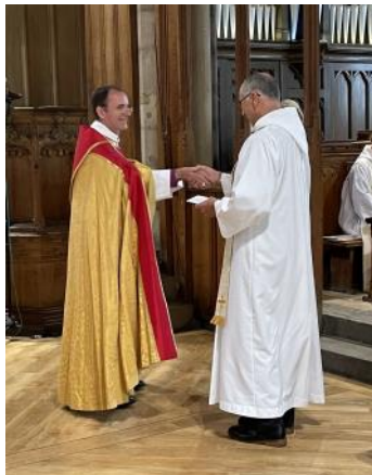
The Bishop greets the newly instituted Rector