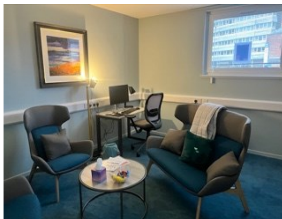
One of the support rooms in Hope Point.

Representatives from Brechin Diocese were recently able to go on a tour of Hope Point. Hope Point is a new and unique Mental Health Crisis intervention centre that is open 24-7, 365 days of the year. This is open for people to access directly, without referral, in person, by phone or by text message. It is in the Hillcrest Centre on South Ward Road in Dundee City Centre.