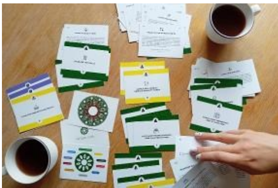
The Net Zero cards available from the office

The Provincial Environmental Group has released sets of "Net Zero cards". The Net Zero Cards help churches engage with actions a church can take that will reduce your energy use and move your charge towards Net Zero. The cards are designed to let a group within a church (maybe the vestry or a working group looking at environmental issues) make sense of what can feel an overwhelming range of issues and possibilities. The cards in the pack cover Energy Efficiency Improvements, Clean Energy, and Positive Finances, the priority areas from our Net Zero Action Plan.