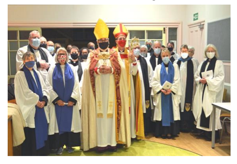
Clergy, lay readers and choir

An enhanced cathedral choir and a good turnout of di-