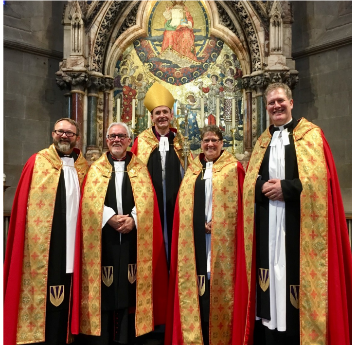
The Cathedral Chapter at the Installation